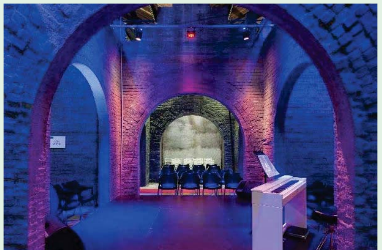
Below: Photo—Spring Hill Reservoirs, Brisbane

Regional participants can live stream the Tribunal to their venue. For more information: www.eartharts.org.au